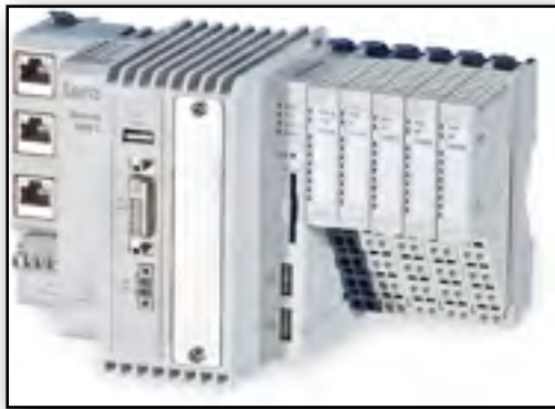
PLC ( Automatic )